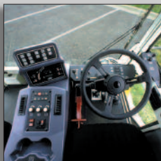
All sweeping functions within easy reach