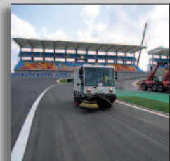
Machine in action