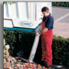
Vacuum wand extends cleaning reach