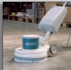
Optional solution tank