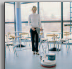
Machine in action