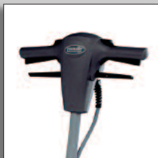
Ergonomically designed & comfortable to use handle